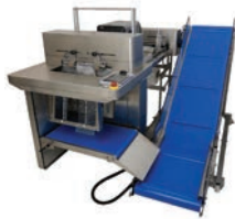
Bag Sealing Machinery