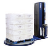
Pallet Wrap Machinery