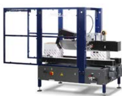
Case & Tray Handling Machinery