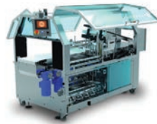
Shrink Wrapping Machinery