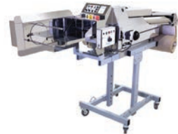
Void Fill Systems