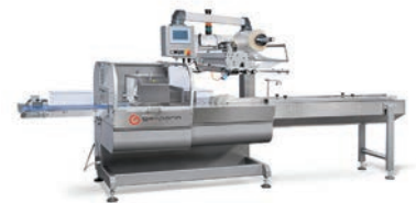
Flow Wrapping Machinery