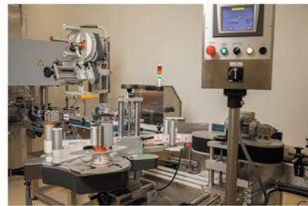
Labelling / coding