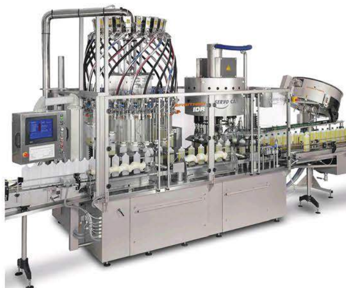
Rotary filling and closing system

Also your specialist for packing hardware, powders and tablets