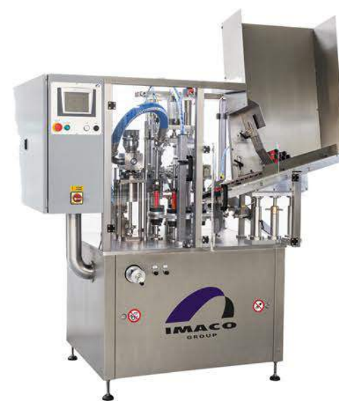
Tube filling system