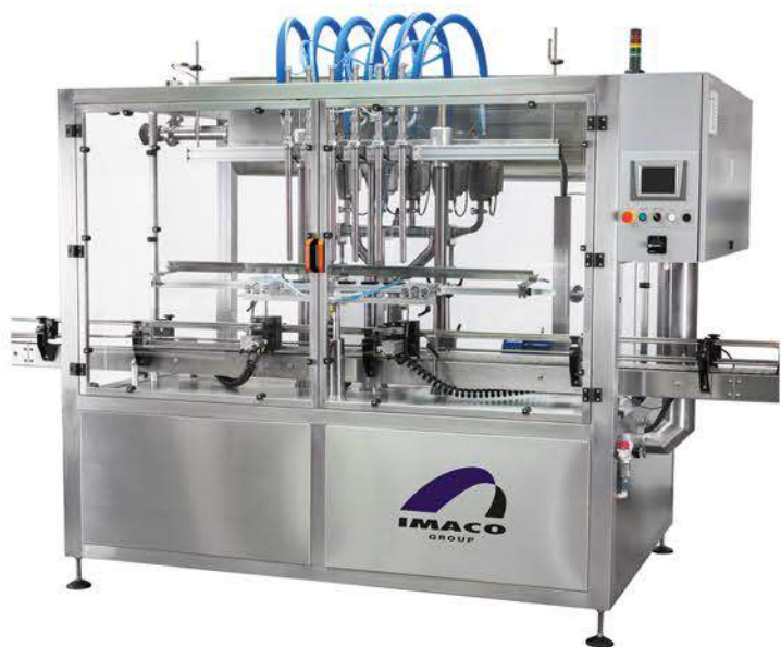
Linear filling machine