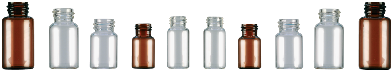
Tubular Type I glass diagnostic/screw neck vials

Tubular glass vials manufactured by SCHOTT from SCHOTT Fiolax® neutral Type I glass tubing. Vials can be manufactured to your precise specification for viable production runs